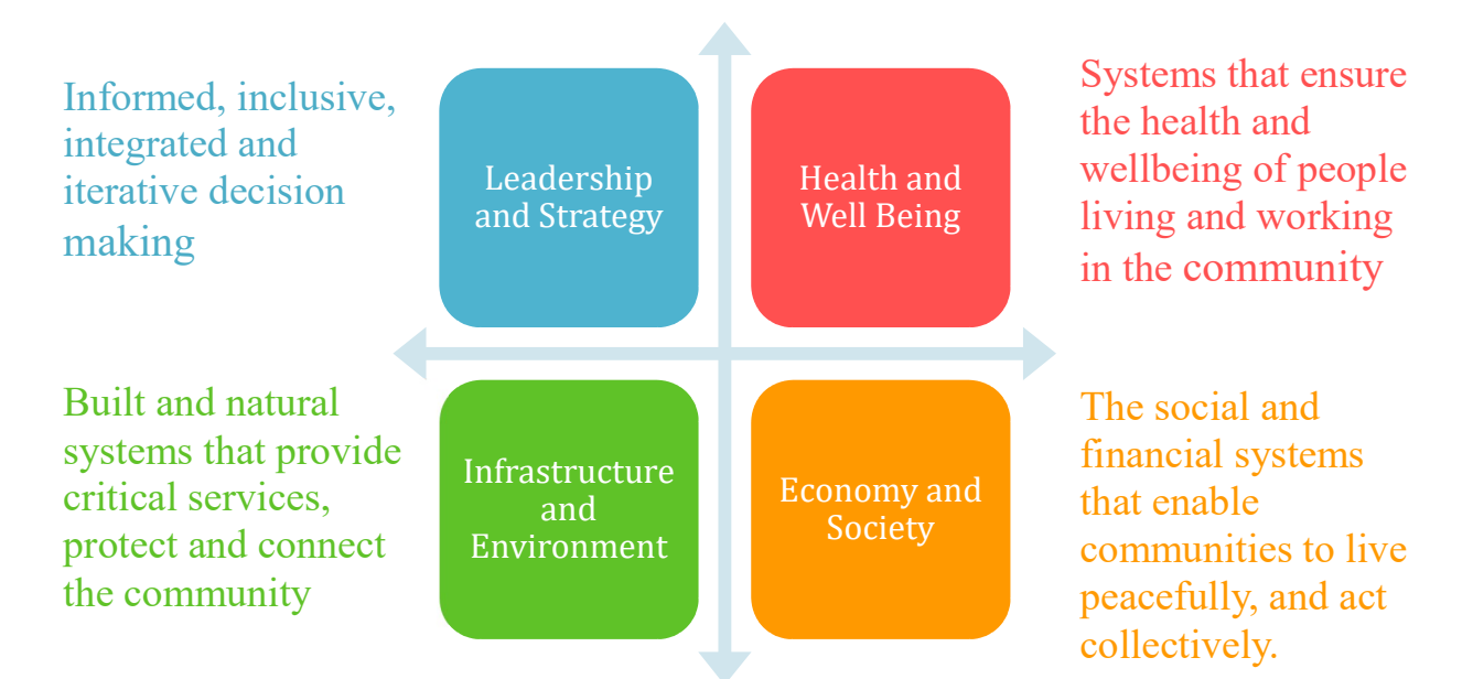
Figure 2: Rockerfeller Foundation's 4 dimensions of community resilience (Arup 2015):

ESPs resiliency vision statements and goals (Appendix 2) were co-developed with the RM's Climate Change Adaptation Steering Committee and public Advisory Committee, with input from Council. They draw inference from our partners, our network, and global frameworks.<sup>9</sup> In doing so they help anchor ESPs actions with those of others building a broader framework of resiliency that reflects back on us, making our community even stronger. The goals acknowledge that choices today have long-term impacts on our quality of life, the environment, and the economy. The needs and interests of the residents, businesses, and institutions of East St. Paul were a core element in their framing. These goals also recognize our interdependencies with the natural environment and neighboring municipalities and reflect that ESP is a member of a broader provincial, national, and world community.